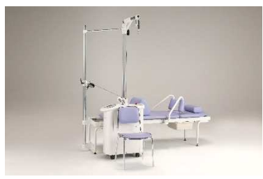
Lumbar & Cervical (AB Type)