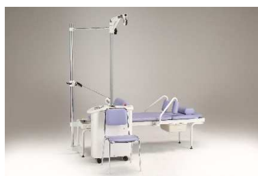
Lumbar / Cervical (AB Type)