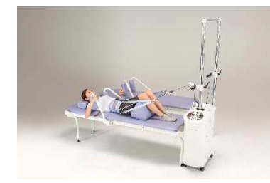
Lumbarx2 (WHA Type)