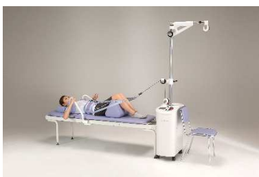
Lumbar / Cervical (A Type)