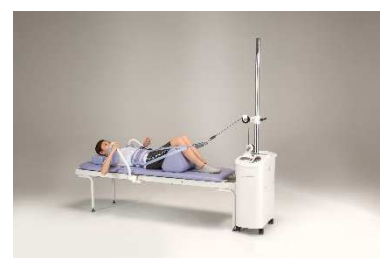
Lumbarx1 (C Type)