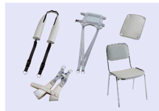
The color of the upper parts is gray.