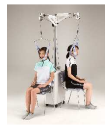
Cervicalx2 (K Type)