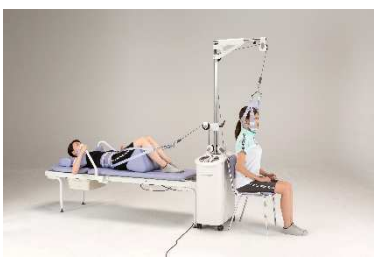
Lumbar & Cervical (A Type)