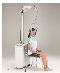
Cervicalx1 (KS Type)