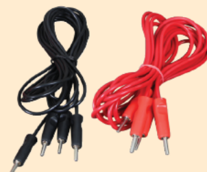
Patient Cables 2 Pairs