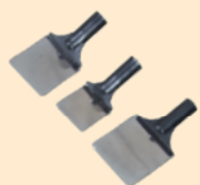
Plate Electrodes 3 sizes