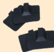
Rubber Electrodes 4 pcs