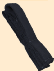
Velcro Straps 3 diff sizes