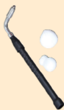
MST Handle Ball Electrodes 2 sizes